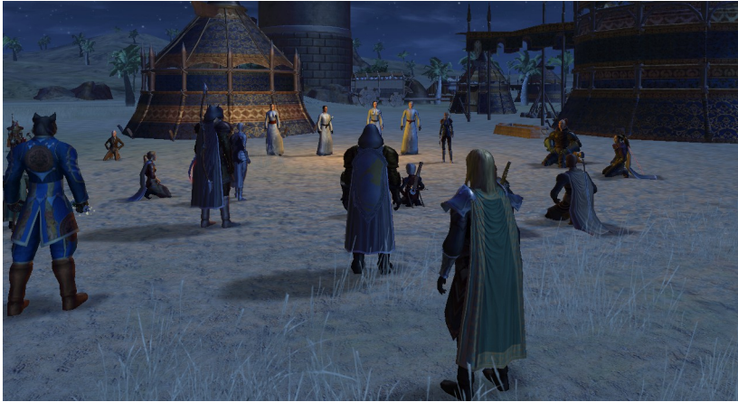
Figure 2. Screenshot of Vanguard: Saga of Heroes. Non-scenario based event created by players: duel tournament.

Second type of player created event concerns narrative roleplay. To write these scenarios use classic techniques, often learned in game. For instance, it is common to base the story on one character's background. Once the narrative framework has been found, players need to design and set up the planning of the event: initial set-up, non-player characters, puzzles, resolution of the plot, etc.