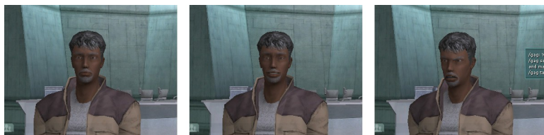
Figure 1. Screenshots of Star Wars Galaxies. Facial animations of a character.

In some games, though, it is possible to animate the character's face and express its emotions in a very precise manner, like a puppet. To trigger one of these animations, the player types in the chat window the action he wants his character to execute like a scripting command: "/smile" or "/bow". The game then launches an animation of the character and indicates in the chat window what action has just been made.