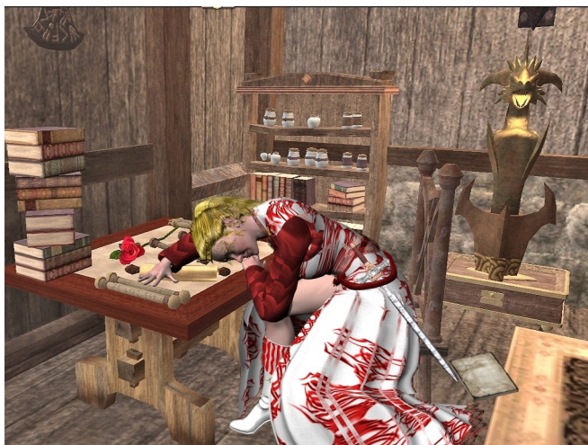
Figure 4. Graphic creation made by Azurielle (pseudonym) of her main character.

For instance, the illustration below, made to illustrate the story of the character Azurielle (Azurielle, 2008), is a mix between a screenshot of Everquest 2 for the environment and an image of the character made with Poser, a software used to create 3D characters.